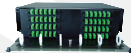
3U 48-96 Ports