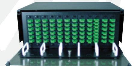
4U 72/96/144 Ports