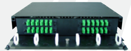
2U 24-48 Ports