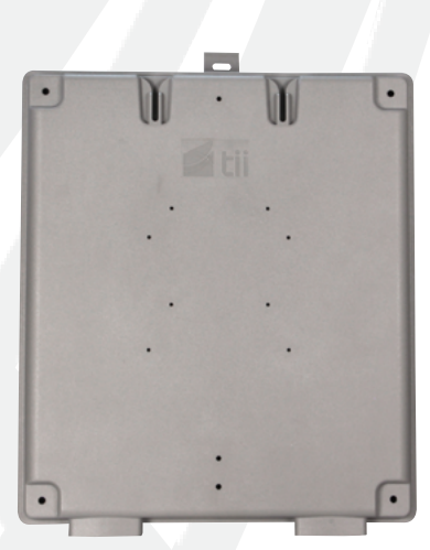
SHOWN WITH REMOVABLE FRONT COVER

The ONT-SE1 is an indoor/outdoor slack storage enclosure which can accommodate up to 100 ft. of flat drop fiber with adjustable fiber retention fingers. This unit ships with hardware necessary to mount several industry standard indoor and outdoor ONTs on the removable front cover which is secured with four screws. Includes mounting provisions for Tii's FP Series adapter plate (not included) which can be used to configure up to 12 fiber terminations.