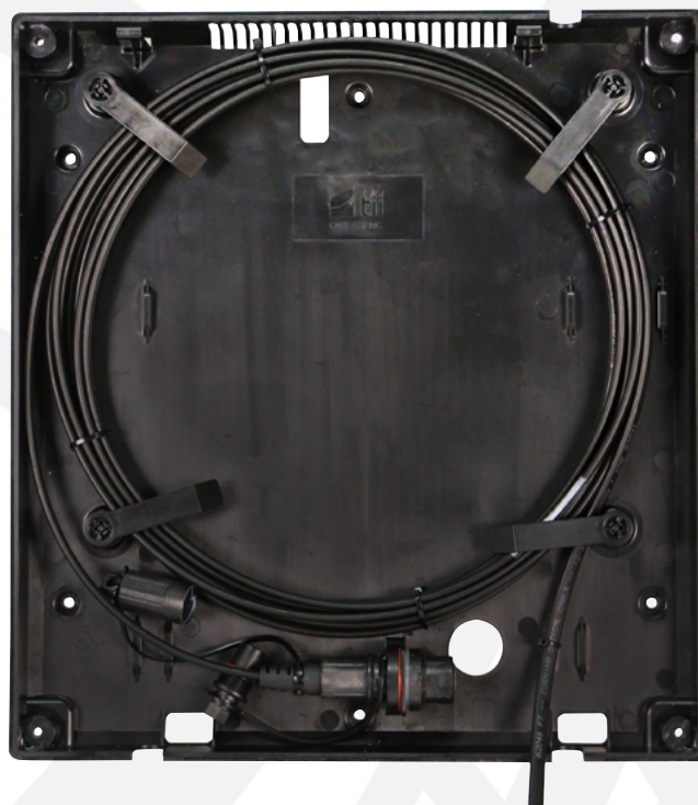
Shown with OSP drop cable and OptiTap™ to SC Adapter (not included)

Av. José de Escandón y Helguera No. 21 Ciudad Industrial Matamoros, Tamaulipas, C.P. 87494, México Phone: 868.812.8011 • Fax: 868.812.8025 salesmx@tiitech.com.mx